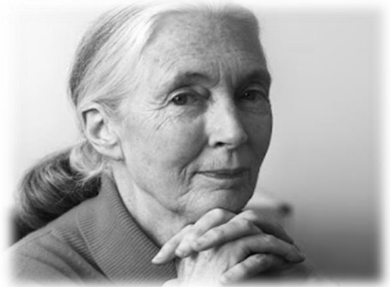
Dr. Jane Goodall Primatologist, Educator, and Activist

“Every individual matters. Every individual has a role to play. Every individual makes a difference.”